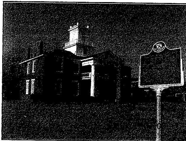
Wilcox Female Institute